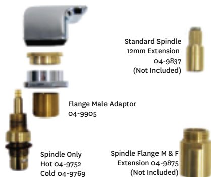
Standard Spindle & Handle Assembly Set up

Extended Spindles (Not Included) Hot 04-9707 Cold 04-9714 Flange Male Adaptor 04-9899